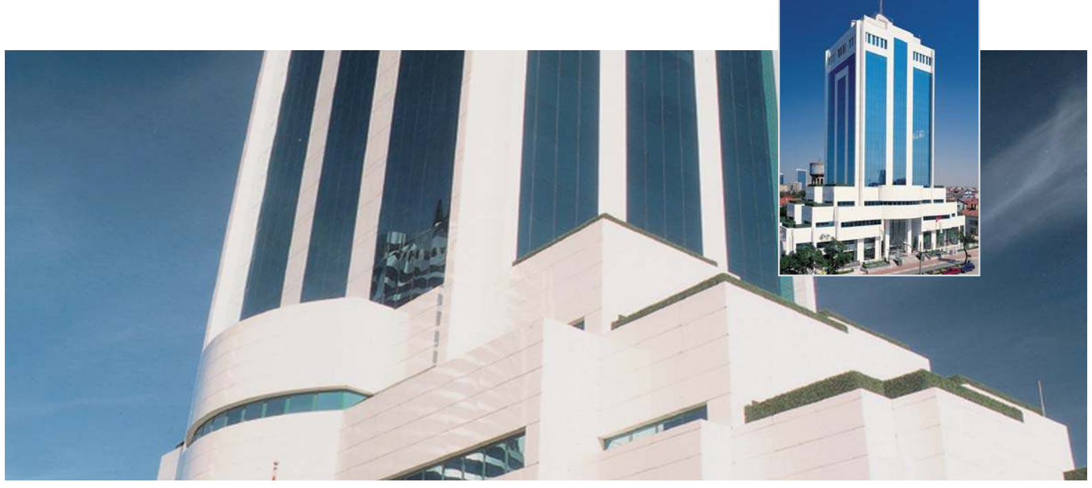
Demir Bank Head Quarters, Istanbul